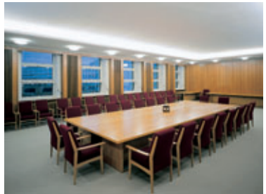
Former meeting room of the Politburo of the SED Central Committee

It is to be found on the ground floor, on the eastern side of the building. Daylight comes from above through openings in the rooftop garden between the ground floor and the first floor. This garden has two functions: it constitutes both the library roof