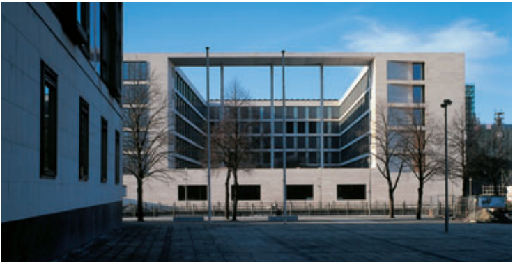
Eastern side of the New Building (above), Reception Courtyard (below)

To this end, Hans Kollhoff developed the three-layer concept. The first layer highlights the modern aspects of the Old Building, which should not be regarded solely as an embodiment of National Socialist architecture. The second layer preserves in an exemplary fashion the building's design during the GDR era. For the third layer, a colour concept was developed in collaboration with the artist Gerhard Merz whose large monochrome surfaces lend the building a modern flair.