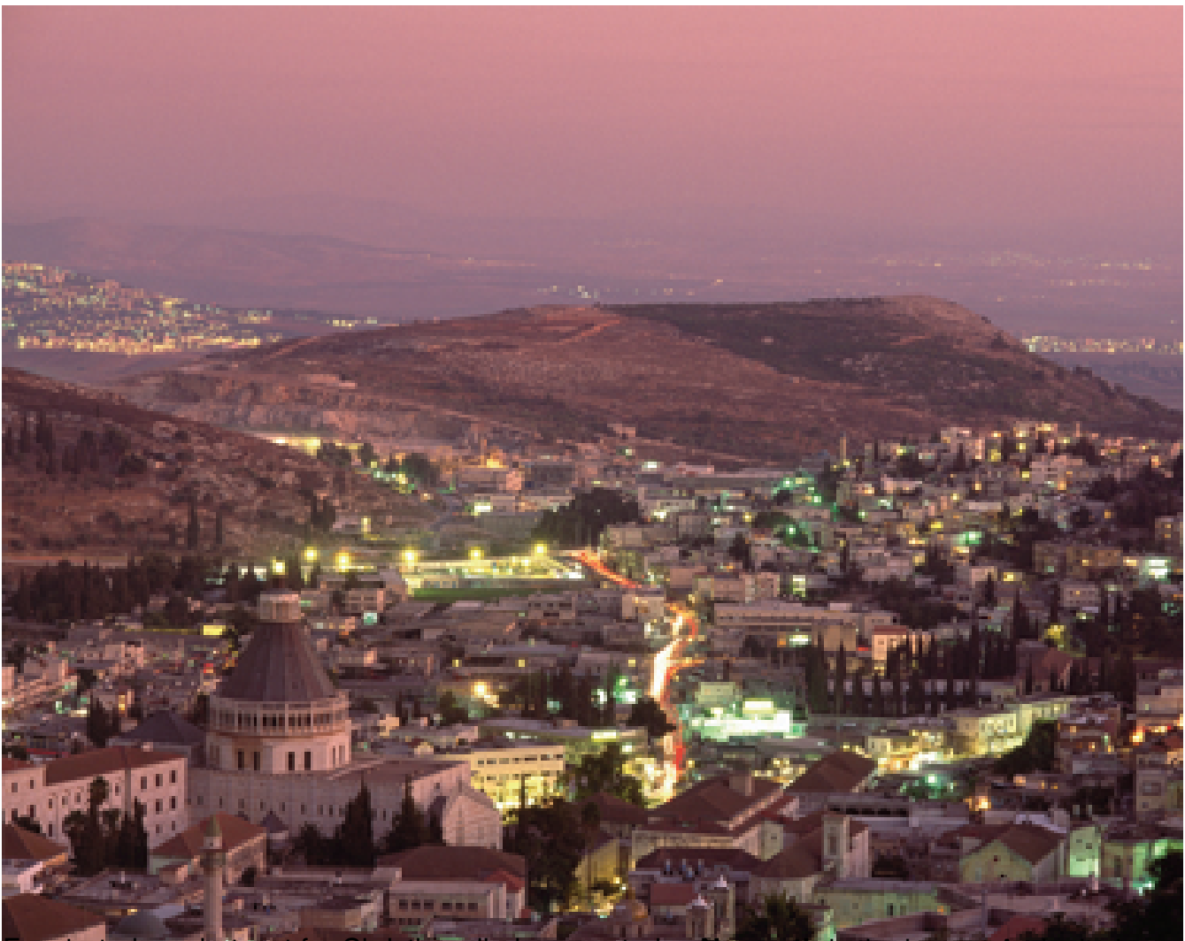
Ispacenturies a hotspot for Christian pilgrimages, today Nazareth is the largest Arab city in

Written by Charisma Staff Wednesday, 26 May 2010 09:41 AM EDT