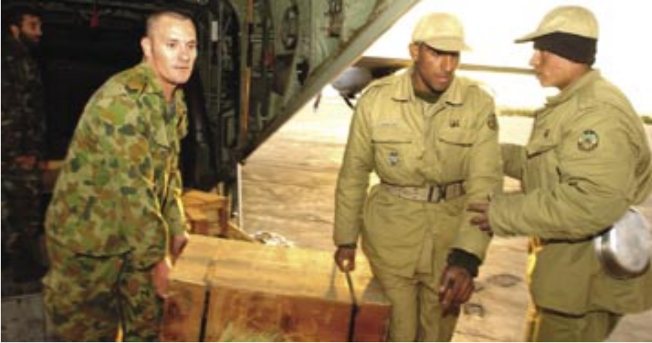
A RAAF crew member is helped to unload emergency supplies by an Iranian soldier during Australia's earthquake relief effort in Iran.