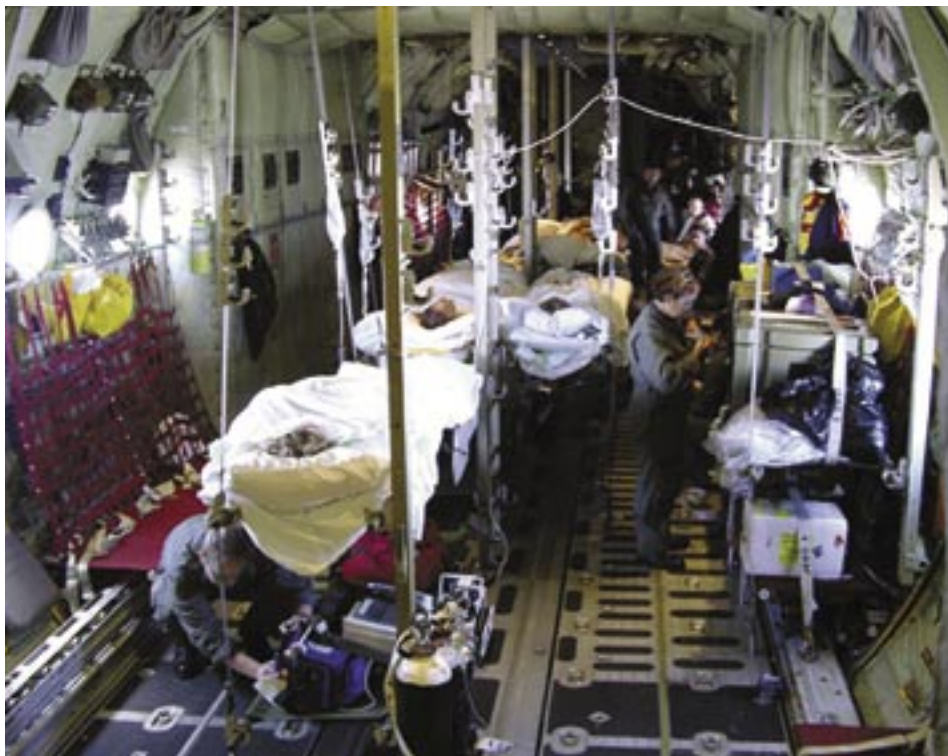
Medical evacuation from Bali following the bombing.