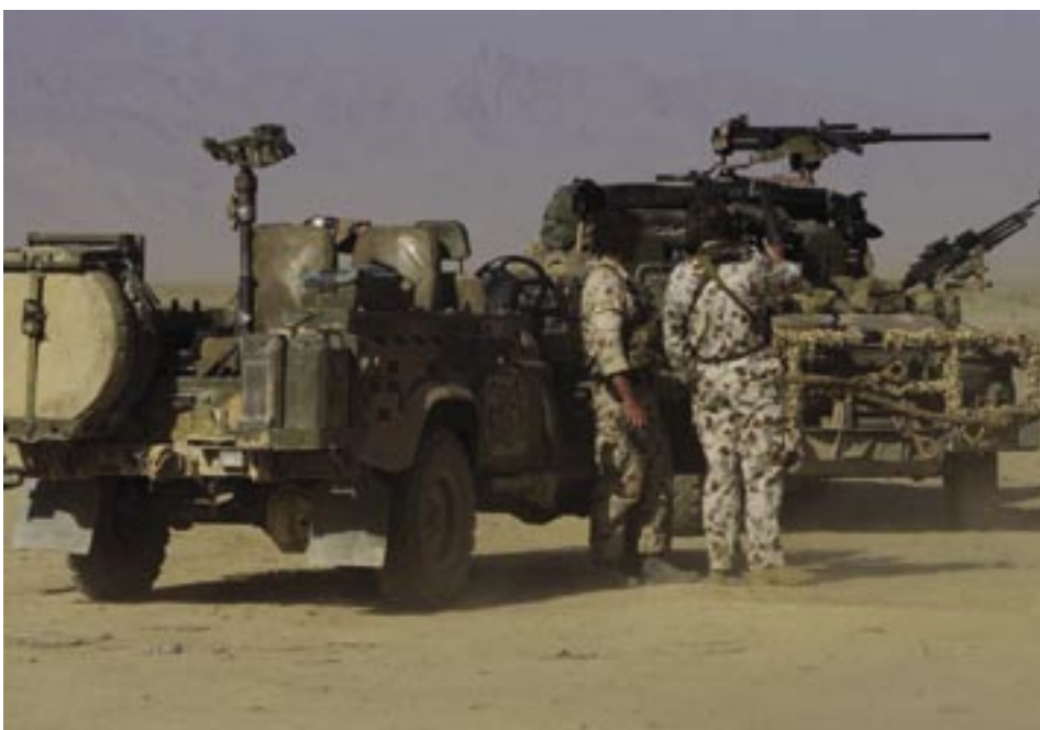
Australian Special Forces Task Group on patrol in Afghanistan. Up to 1300 ADF personnel served there as well as Kyrgyzstan and the Persian Gulf.