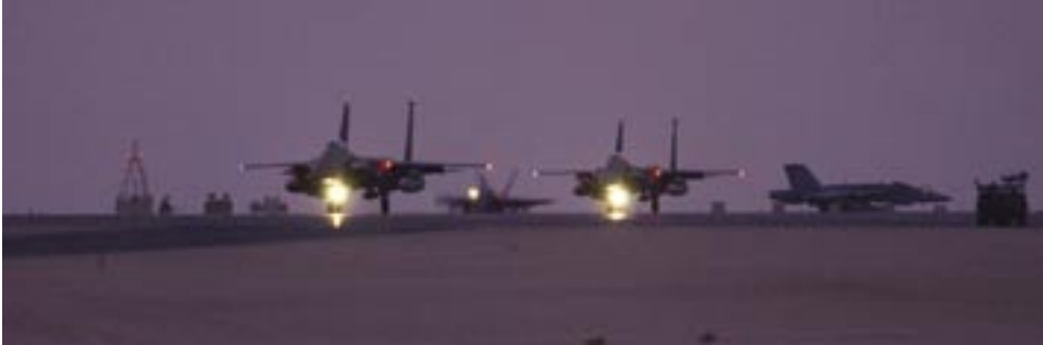
RAAF F/A-18s prepare for a sortie.