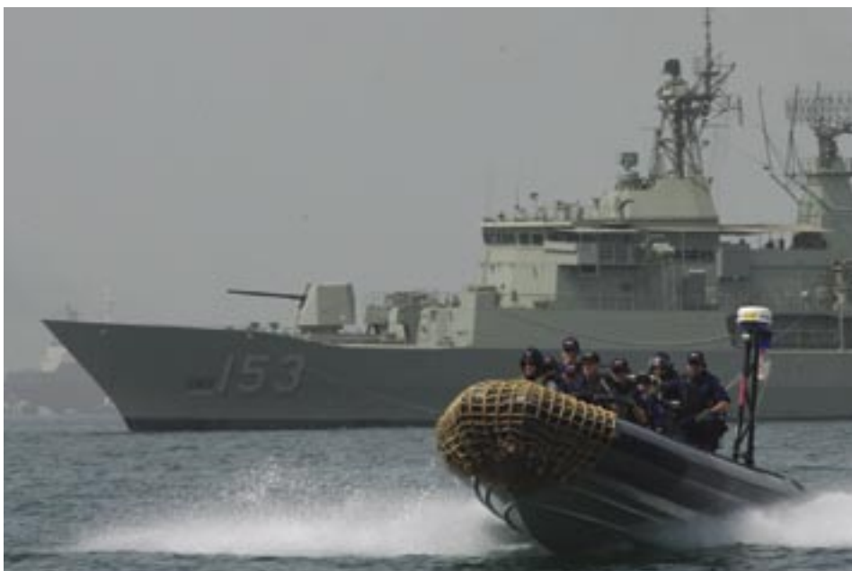
A search team heads out while HMAS STUART is on station in the North Arabian Gulf.