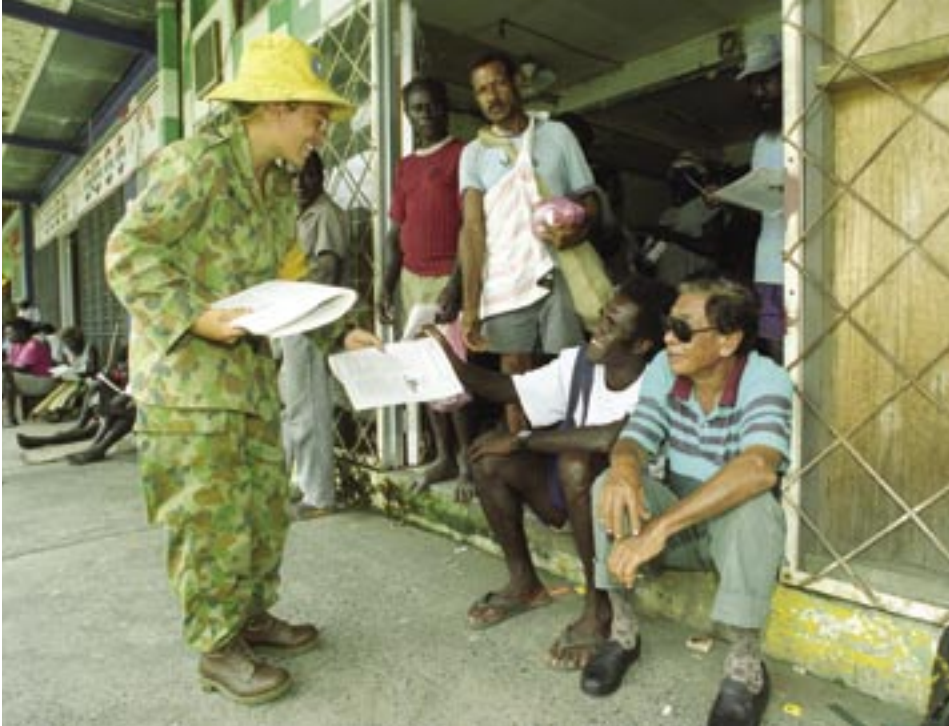
Rebuilding the peace can take many forms.

disrupt the mine's operations. The Royal Papua New Guinea Constabulary and then the Papua New Guinea Defence Force were unable to contain the growing crisis, resulting in nearly a decade of strife.