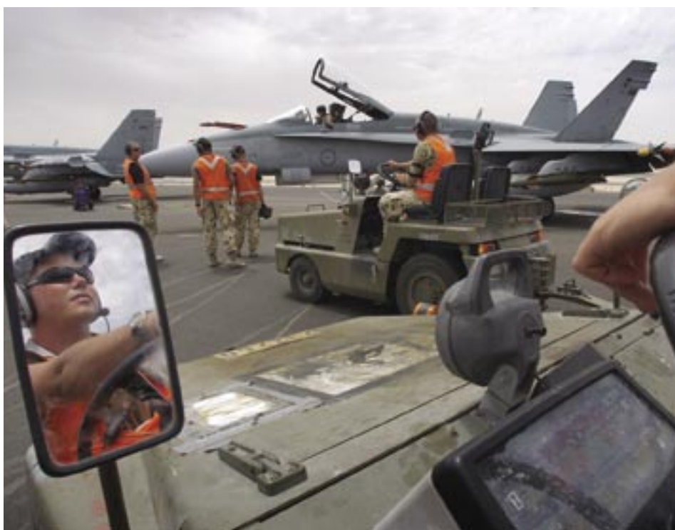
The F/A-18 detachment was part of Australia's contribution to Coalition efforts in Iraq.