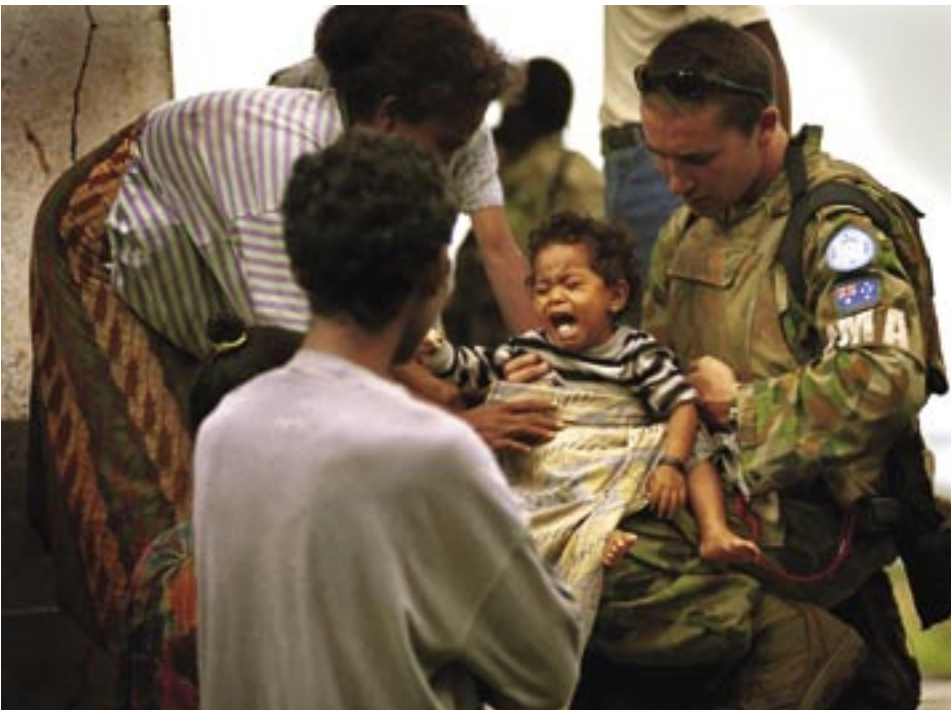
An Australian Army Civil Military Affairs soldier treats adults and children in East Timor.