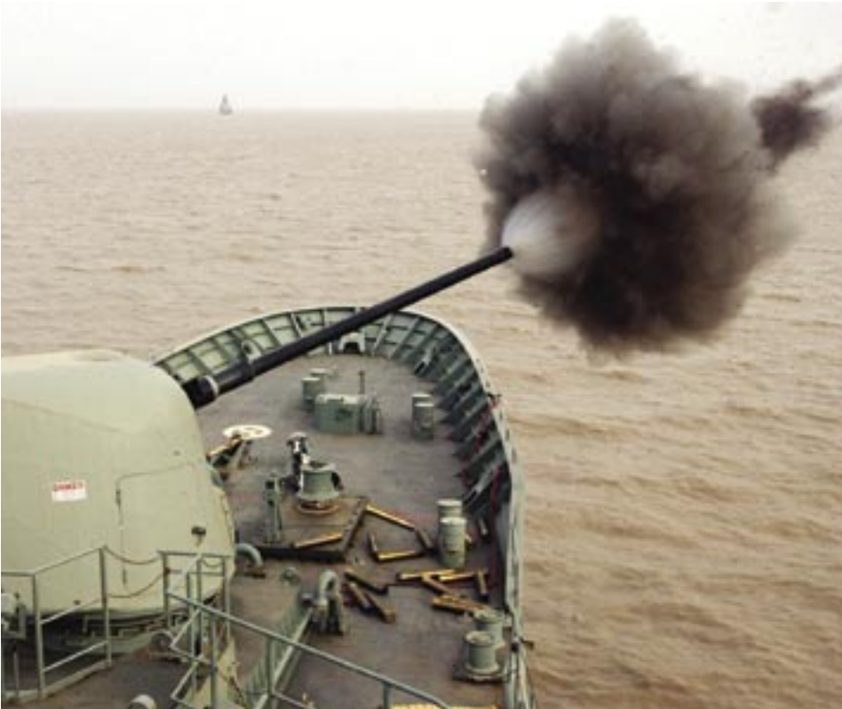
HMAS ANZAC fires its 5 inch gun in anger after a call for fire support during hostilities in Iraq.

into our force structure, including the establishment of: