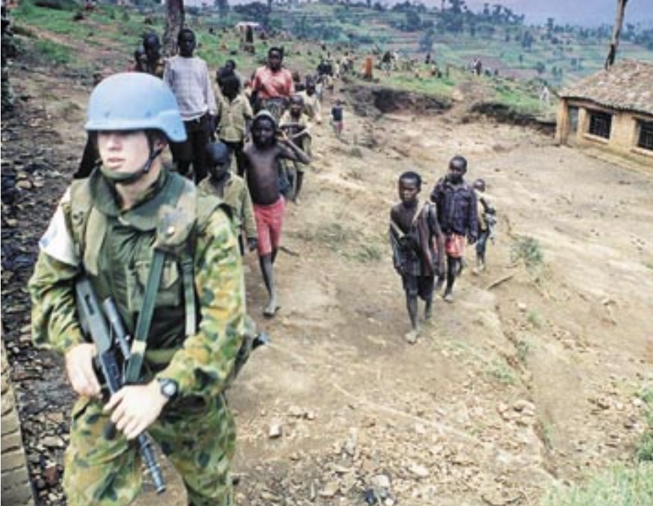
A peacekeeper helps restore order in Rwanda.