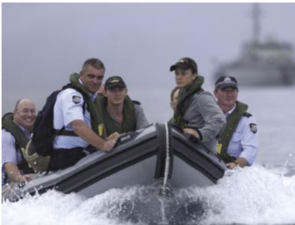
Australian Federal Police officers catch a lift from the Navy.

The ADF also provides maritime surveillance advisers to many South West Pacific nations to assist them in protecting their vital national maritime resources.