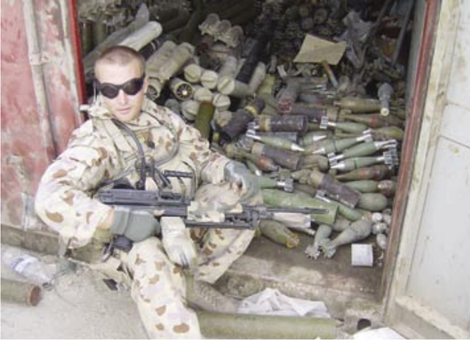
A Navy Clearance Diving Team member guards a weapons cache found during a sweep of Al Basrah Naval Base.