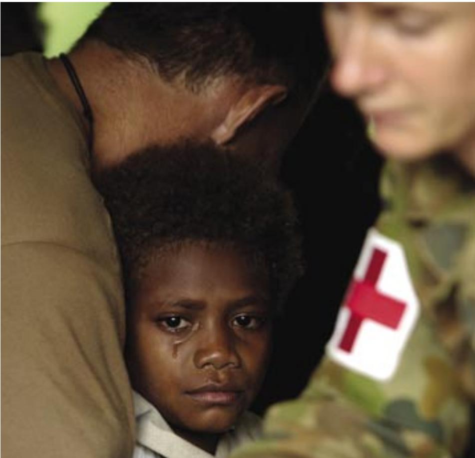
An 8-year-old girl is stabilised before a medical evacuation to Honiara after she cut herself with a machete while trimming coconuts.