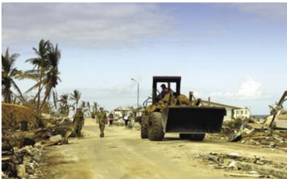
Troops walk through the streets of Niue amid the destruction caused by Cyclone Heta.