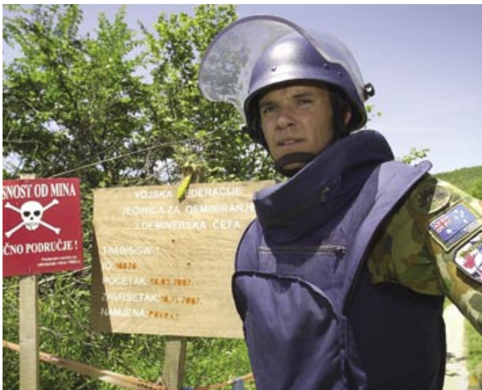
An Australian soldier monitors demining operations in Bosnia-Herzegovina.