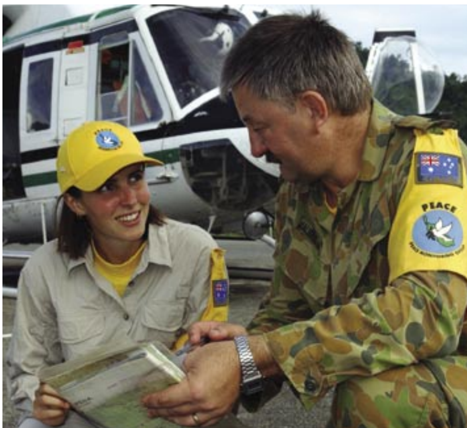
A Defence civilian and an Army Reservist plan the day's helo-borne activities as part of their Peace Monitor roles.

The ADF is strongly committed to helping isolated and indigenous communities throughout Australia in the development of local infrastructure, facilities and services. This has included the construction of roads, the digging of wells and bores, the fabrication of buildings and the repair of local utilities infrastructure. In some cases, where natural disasters and other events have necessitated the moving of communities, the ADF has been an integral part of the relocation process. The ADF's programs aimed at assisting these communities have been an outstanding success, and have lead to many positive benefits to both the communities themselves and the ADF.