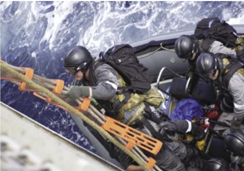
A Navy boarding party prepares to go aboard a suspect ship.