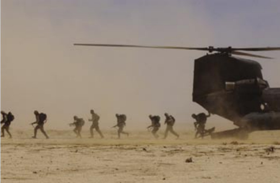
Australian troops are placed in position during Operation FALCONER.

frigates and one amphibious ship at the end of 2001;