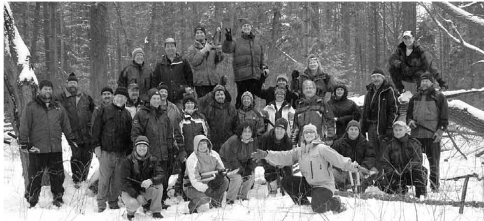
As part of the field trip at the Toronto workshop hosted by the FTE in partnership with The Fraser Institute, 27 teachers participated in the Nature Conservancy’s “Volunteer for Nature” program at Turkey Point, in Southern Ontario, February 28th, 2005.