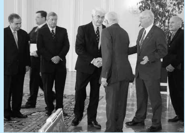
Fraser Institute delegates meet with Czech President Vaclav Klaus at Prague Castle, the presidential residence, in October.

The study's evidence is overwhelmingly compelling. It shows that many of the countries that offer universal access to health care do better than Can-