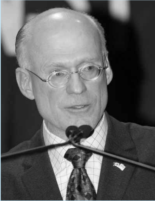
M. Ridewood, Canadian Press

staff of the Institute and has mapped out an ambitious program of research and development activities for the coming years.