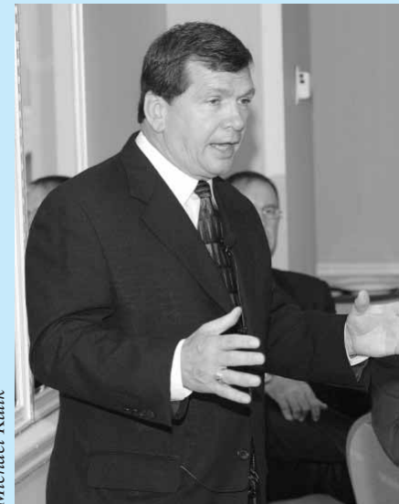
Canadian Ambassador to the US, Frank McKenna, speaks to delegates during the Institute's Washington excursion in June.