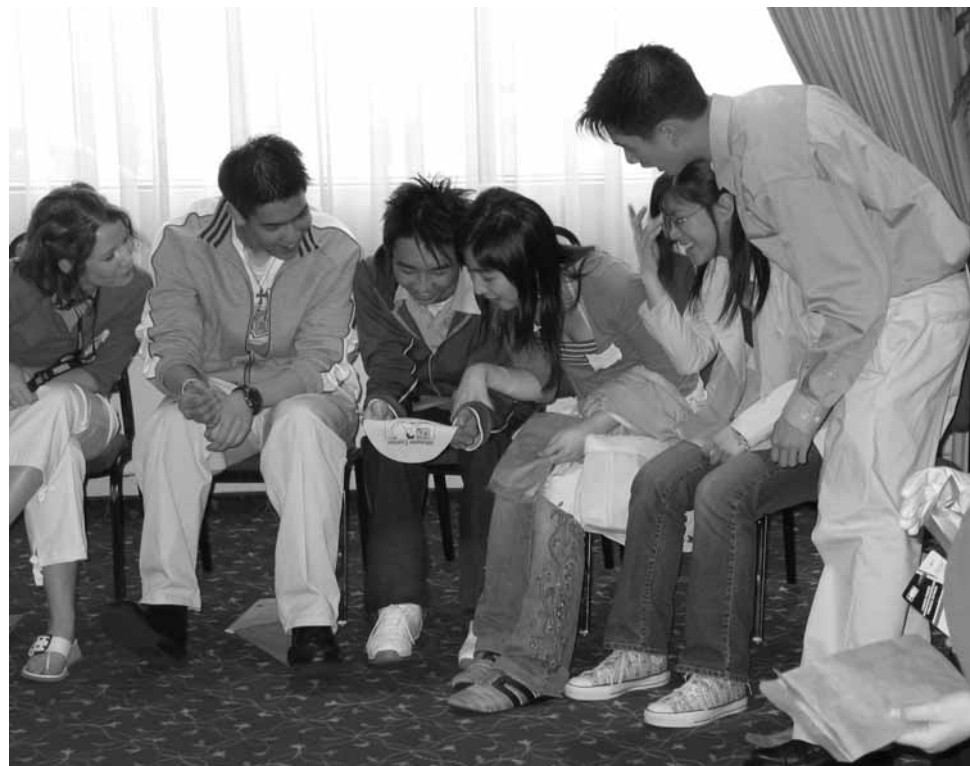
Students participate in the popular "trade game" at the seminar for high school students in Vancouver in April.