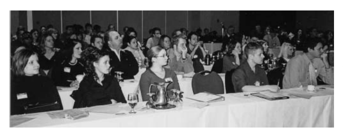
Students in Edmonton turned out in force in February to hear policy analysts explain how to better understand public policy issues at one of the Institute's popular student seminars.