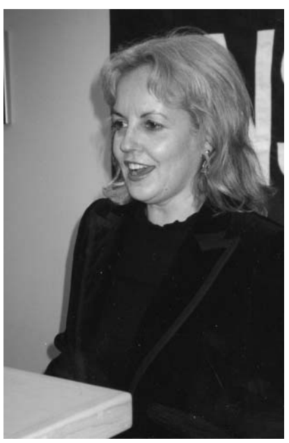
National Post columnist Elizabeth Nickson explains "How Cultural Policy in Canada Became a Tool for Socialist Mind Control" at a Fraser Institute policy briefing in Vancouver.

In addition to the Fraser Alerts, the Institute also produces a Digital Publication series. These are shorter research papers designed specifically to be read on-screen; the typeface and the layout were both developed with our growing web site audience in mind. While the material is very accessible on the desktop, the publications can also be printed from people's own computers and read in hard-copy format. Three digital publications were produced and posted on The Fraser Institute web site (www.fraserinstitute.ca) in 2003: Is there Really a Looming Labour Shortage in Canada and, if there is, can Increased Immigration Fill the Gap? by Martin Collacott; The Privatization of Liquor Retailing in Alberta, by Douglas S. West; Accountability for Subordinate Legislation: The Case of the Aboriginal Communal Fishing Licences Regulations, by William Stanbury.