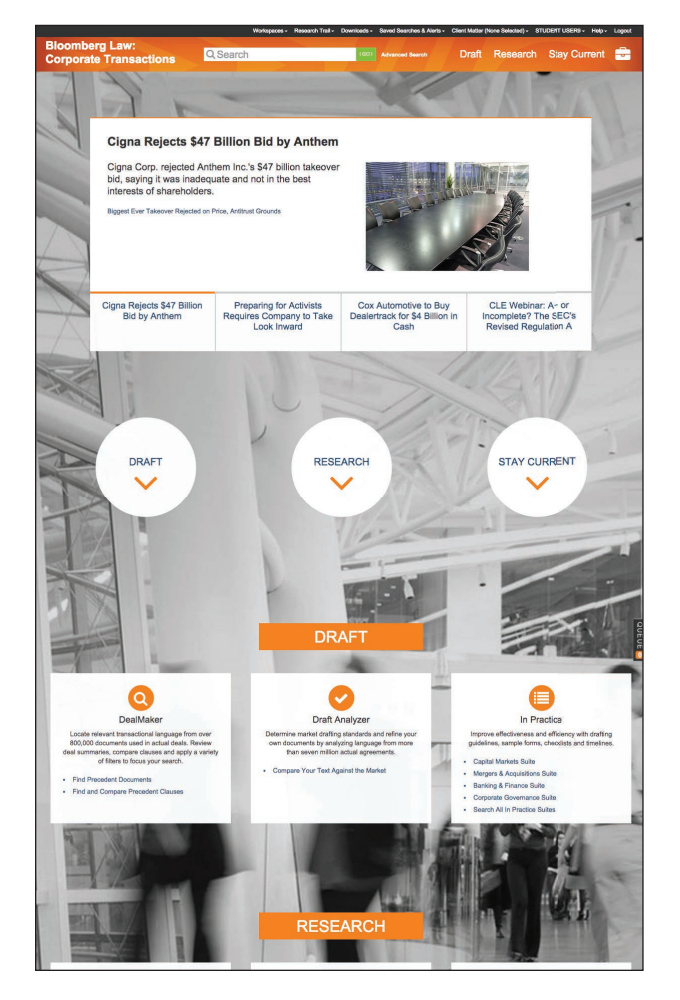
* Bloomberg Law: Corporate Transaction is available to Bloomberg Law subscribers at no additional fee. It is also available as a separate, stand-alone subscription.

When you open one of your EDGAR Search results, you get a chart of the impact of the filing on the related stock price. In addition, you now can search for and perform comparisons of items in 8-Ks, 10-Ks, and risk factors in 10-Ks, and compare your own text to the results.